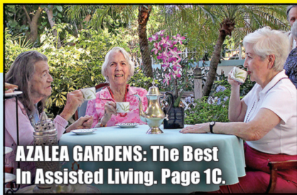
AZALEA GARDENS: The Best In Assisted Living. Page 1C.