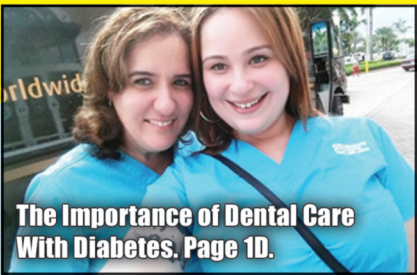
The Importance of Dental Care With Diabetes. Page 1D.