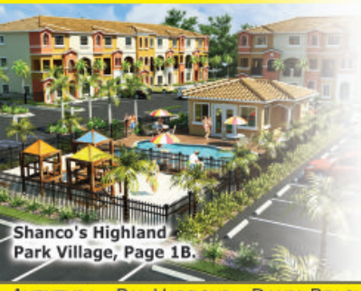
Shanco's Highland Park Village, Page 1B.