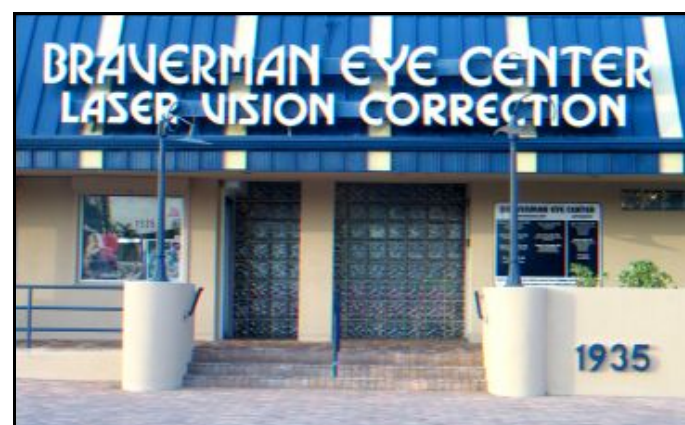
The Braverman Eye Center is located at 1935 E Hallandale Beach Blvd., Hallandale Beach.