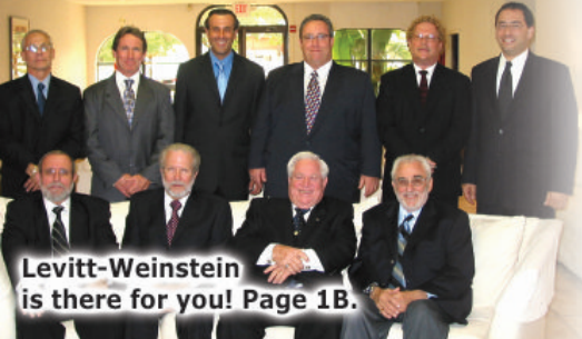
Levitt-Weinstein is there for you! Page 1B.

THURSDAY, SEPTEMBER 25, 2008 • 32 PAGES • VOLUME 7 • ISSUE 3