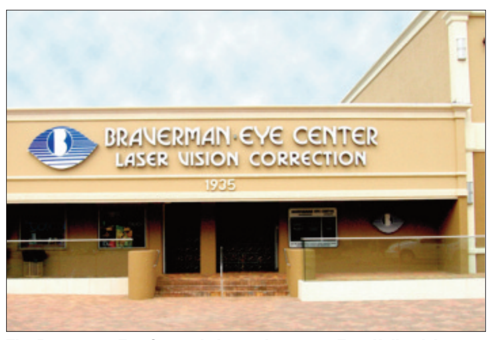
The Braverman Eye Center is located at: 1935 East Hallandale Beach Boulevard, Hallandale Beach, FL 33009. www.bravermaneyecenter.com

ication or surgery depending on your symptoms, complaints and age. Usually surgery will not be recommended until glasses no longer work to make you visually happy. In the case of clear lensectomy surgery, the patient cosmetically wants to get rid of their glasses, but they are out of the LASIK treatment range. CATARACT SURGERY: